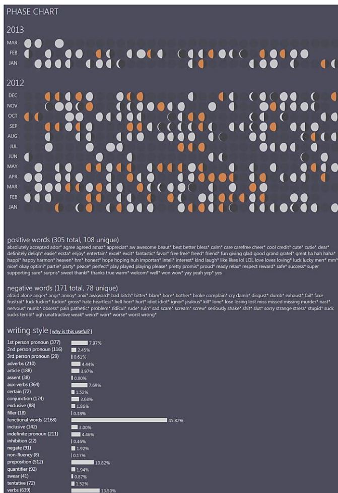
Figure 1. Screenshot of Moon Phrases for a particular Twitter user. engagement with the social landscape. Therefore observing the volumes of postings on Twitter longitudinally was an important cue for reflection.

A core challenge of the design process was identifying what are the best social media cues to be visualized, based on an end user’s activity that can promote emotional wellness. We focused on Twitter as the social media tool, because of its data availability within our organization; however our tool could be easily adapted to any other social platform, such as Facebook or email. Our interactions with the fluent social media participants made it clear that patterns and levels of activity of a user define their interactions and overall